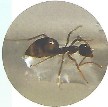
odorant house ant

Identifying what species of ant is present in a structure is the first step that a professional takes when battling an ant infestations.