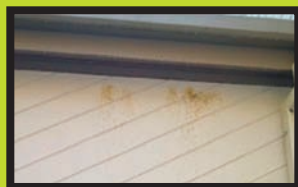
Carpenter bee staining on fascia board of house.

Both males and females can be aggressive and territorial as well, and will dive bomb you as you approach their nest sites. However, stings from female carpenter bees are rare. (Males do not have a stinger and do not sting at all.) Still, most homeowners do not want to have to deal with aggressive bee like pests that destroy their home. Remember to call us, your pest professionals to assist you in treating and preventing further carpenter bee attack and damage to the wooden parts of your home. We'll get those carpenter bees to buzz off ... so you can enjoy the nice spring weather! ■