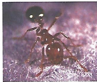
red fire ant