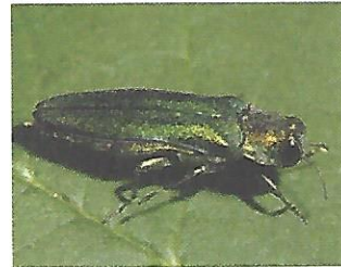
emerald ash borer

T he term 'invasive species' refers to plants or animals that are currently living in a place in which they are not native. The presence of an invasive species is likely to cause harm to its new environment, economic damage or pose a health risk. Many times invasive species are ill-suited to their new environment and don't survive. However, some invasive species can flourish because their new environment may lack predators or other methods of population control to keep the new species in check. This allows them to out-compete our native species and can cause an unbalanced ecosystem or even localized extinctions!