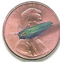
emerald ash borer (scale)

You may have heard of some of the notorious invasive species in the United States like the gypsy moth, buckthorn, red imported fire ant and the emerald ash borer. Invasive species have become a very common occurrence in North America during the last 20 to 30 years. There has not been a single cause but the increase in interstate transportation and a global economy has accelerated the process. There has been a lot of effort focused on preventing invasive species but the task is so big that it is an ongoing struggle.